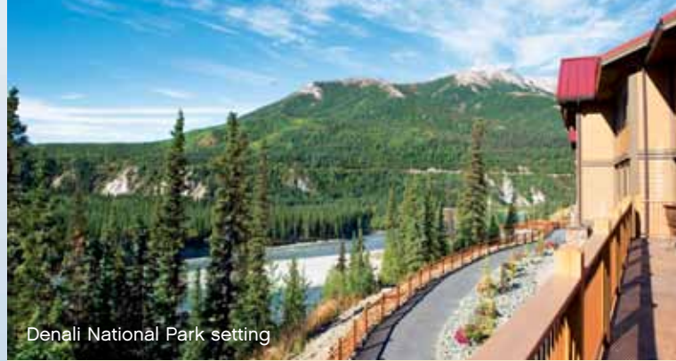
Denali National Park setting

An array of dining venues is always just a short walk from your room. There are casual eateries like the Base Camp Bar & Grill, Lynx Creek Pizza & Pub or the more sophisticated King Salmon Restaurant.