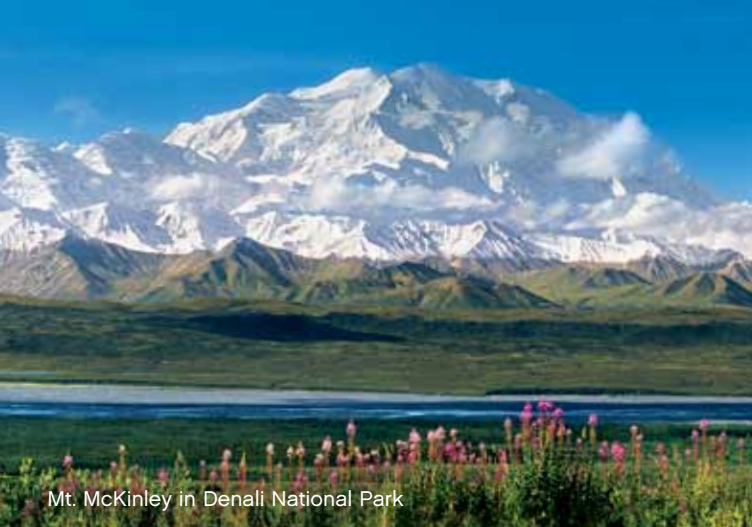
Mt. McKinley in Denali National Park