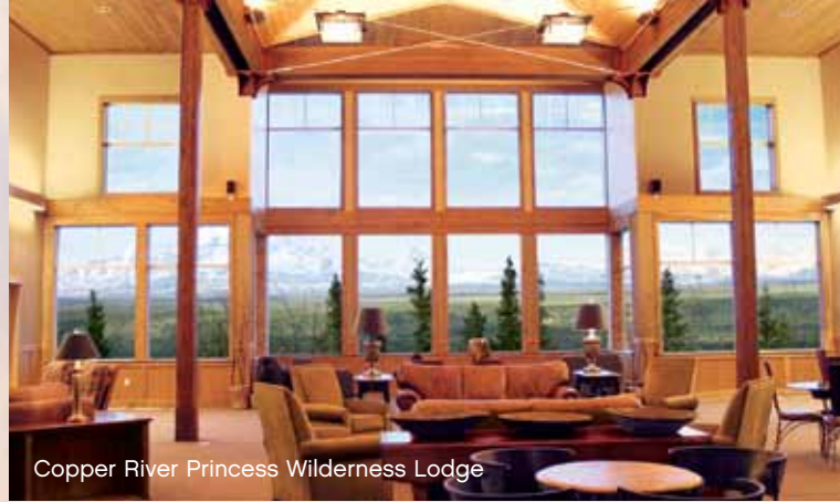
Copper River Princess Wilderness Lodge