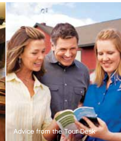
Advice from the Tour Desk