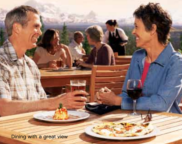
Dining with a great view

Amenities at the Copper River Princess Wilderness Lodge include an all-day espresso bar, public PCs with internet access, a gift shop for those all-important souvenirs, and a Tour Desk with helpful staff to answer any questions you may have about exploring the region.