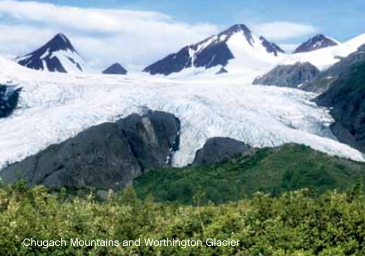
Chugach Mountains and Worthington Glacier